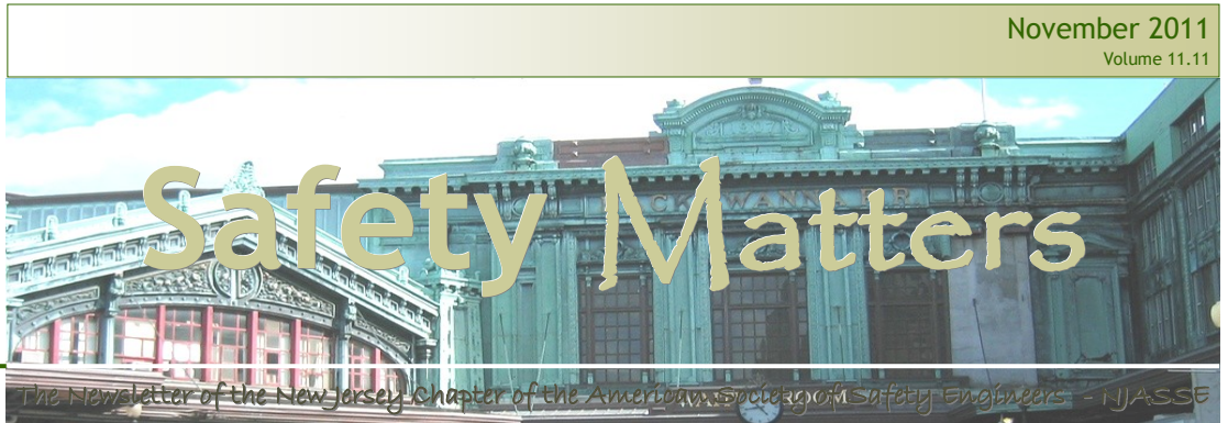
The Newsletter of the New Jersey Chapter of the American Society of Safety Engineers - NJASSE